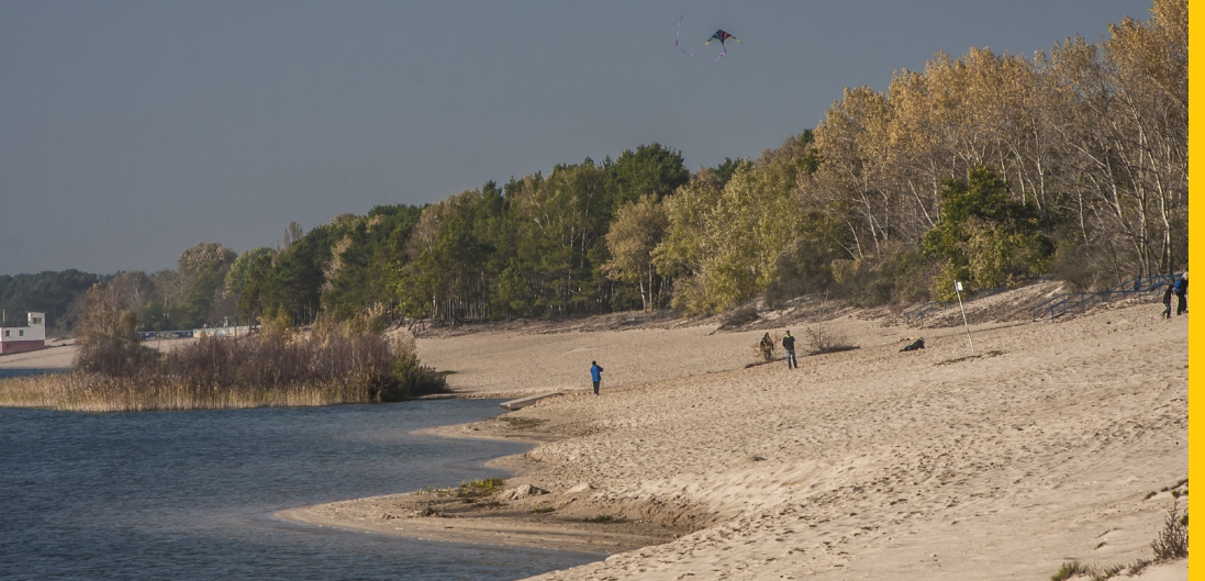
○ Haida Fact